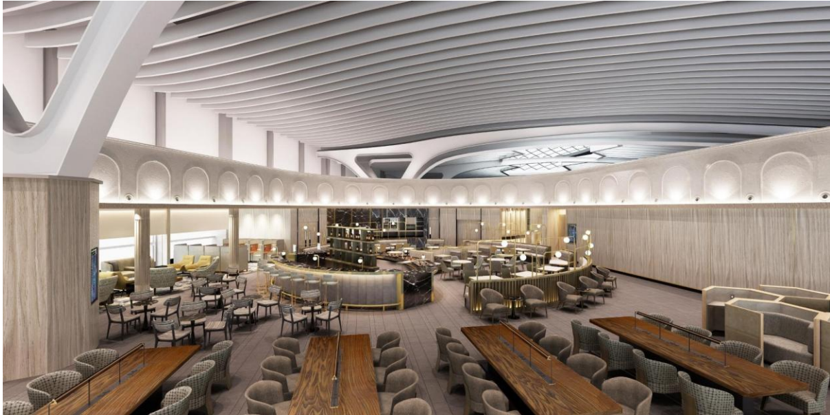
Plaza Premium Lounge in Rome welcomes all travellers, regardless of their airline or class of travel.

Colosseum arena and with the familiar roman column pillars, it reinforces a sense of place of this country, rich in heritage and cultural history.