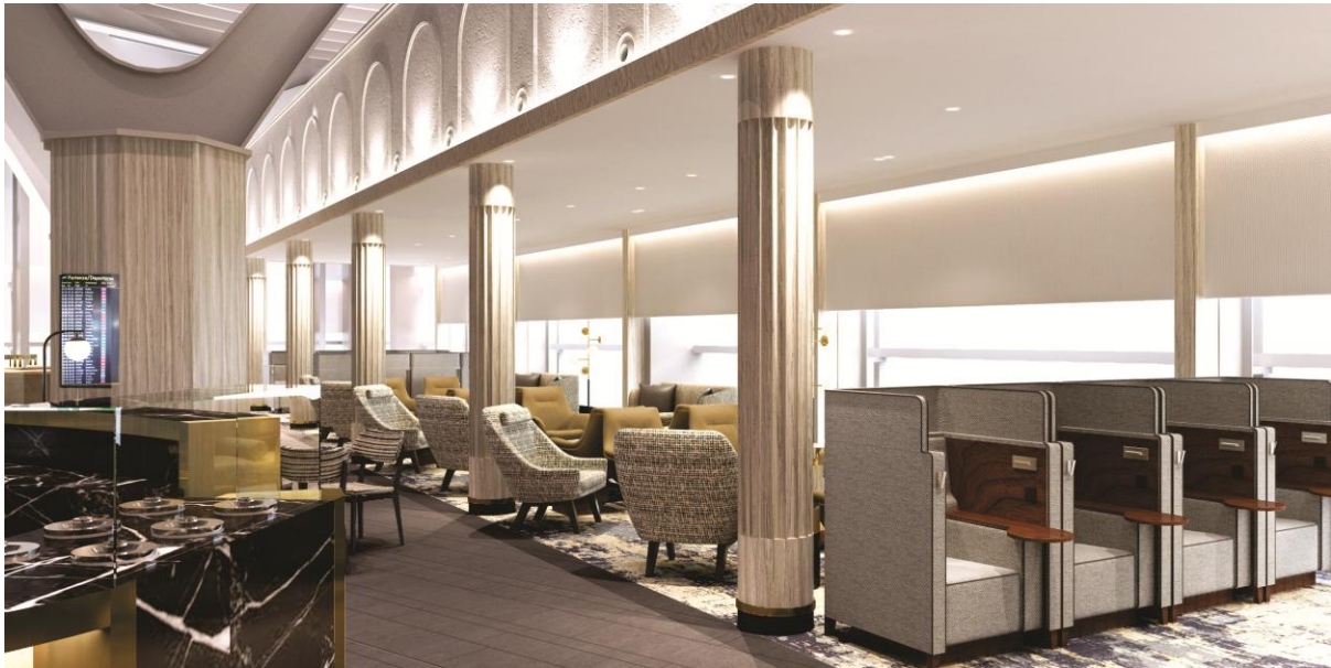
These charming column pillars give the lounge a unique sense of place

Travellers have the option of pre-booking on the website ( www.plaza-network.com ) for two and five hours lounge use packages. Prices start at EUR 40 for two hours' lounge access including shower.