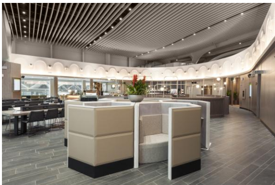
Signature honeycomb settings, offering privacy

Offering 300 comfortable seats including the signature honeycomb seating to provide extra privacy, this lounge is open 24 hours daily and also houses six shower rooms - the first of its kind in Fiumicino Airport - with amenities for guests to refresh before their onward journey.