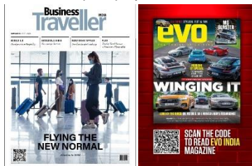
Magazine placement & cover wrap