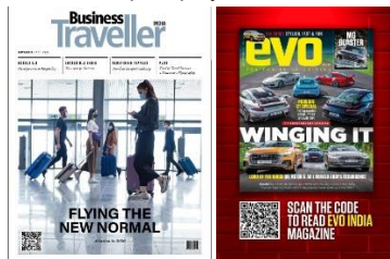
Magazine placement & cover wrap