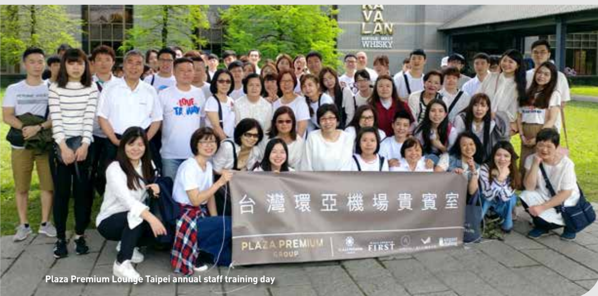
Plaza Premium Lounge Taipei annual staff training day