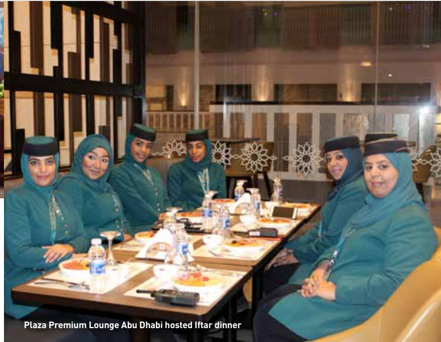
Plaza Premium Lounge Abu Dhabi hosted Iftar dinner

Taking part in local traditions, the team at Plaza Premium Lounge Abu Dhabi hosted an Iftar dinner across all Plaza Premium Group locations in the Middle East to thank the Group's airline partners for their support. Attendees included British Airways, KLM Royal Dutch Airlines, and Turkmenistan Airlines.