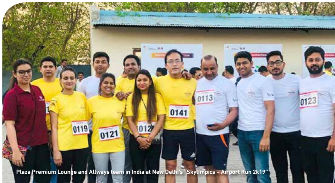
Plaza Premium Lounge and Allways team in India at New Delhi's "Skylympics – Airport Run 2k19"