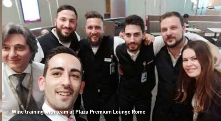
Wine training with team at Plaza Premium Lounge Rome