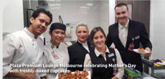
Plaza Premium Lounge Melbourne celebrating Mother's Day with freshly-baked cupcakes

In Australia, the Staff Shake 'n Bake is a monthly employee engagement initiative at Plaza Premium Lounge Melbourne where colleagues are encouraged to connect and improve their knowledge of the hospitality industry. The lounge also celebrated Mother's Day with specially-baked cupcakes.