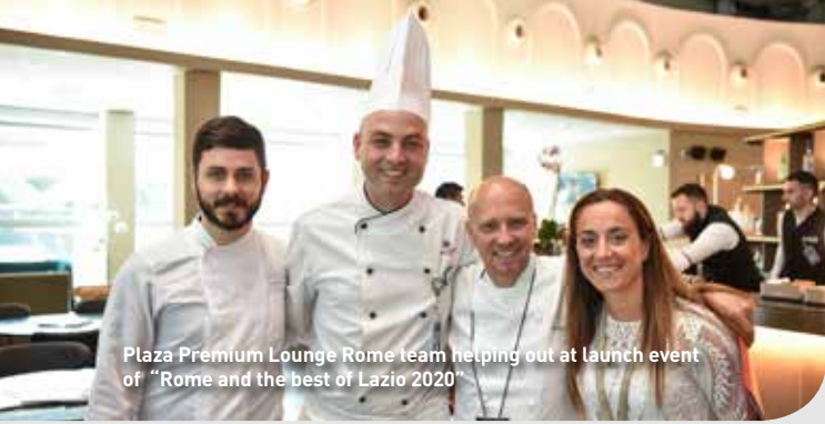
Plaza Premium Lounge Rome team helping out at launch event of "Rome and the best of Lazio 2020"