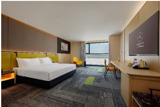
Premier Double (Runway View)

Aerotel's debut in Shanghai marks a significant milestone for Plaza Premium Group, strategically expanding its global service network at one of the world's leading aviation hubs. Shanghai Pudong International Airport (PVG), renowned for its high passenger volume and extensive flight connections, serves as a vital gateway between China and the world. The launch of Aerotel Shanghai is a targeted initiative to deliver premium airport accommodation for international travellers. It caters to a range of needs from transit and layovers to departures and arrivals, further enhancing Shanghai Pudong International Airport's service standards and competitiveness, and becoming a crucial part of Plaza Premium Group's global network.