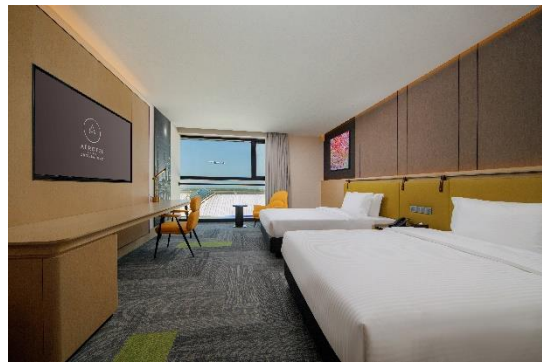
Premier Twin (Runway View)