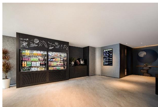
Grab and Go (6/F)